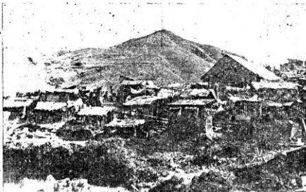
GENERAL VIEW OF THE CAMP