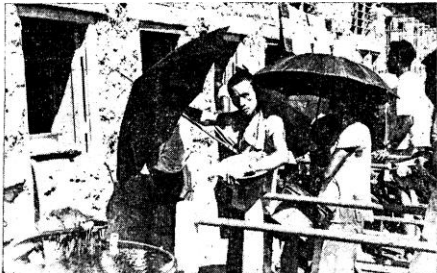
WAITING FOR RATIONS OUTSIDE THE COOKHOUSE