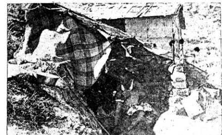
A HOME MADE FROM ODDS AND ENDS!