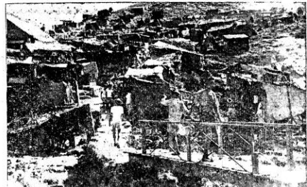
ONE OF THE MAIN THOROUGHFARES