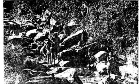
Refugees bathing in one of the streams on the hillside.