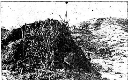
A HOME MADE FROM RUSHES