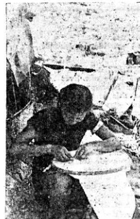
A woman embroidering a stack of cards which she hopes to put up for sale in Hong Kong.