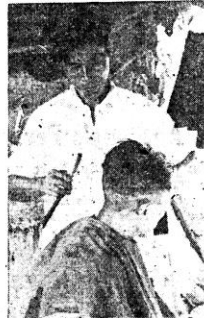
A barber's shop has been set up by a refugee.