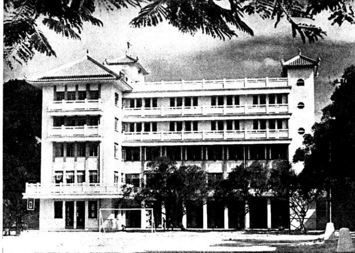
The new wing at Holy Spirit Seminary, Aberdeen, Hong Kong.

since we moved the minor seminary from Saikung in the New Territories to Pokfulam Road in 1957, and as we pause for an appraisal of its development, we realise that while much has been achieved, a lot more yet remains to be done. In fact, a training place like a seminary will always need updating, renewal and improvement. Let us provide it together, the faithful with their clergy and their bishop, each according to his ability. Together, by the grace of God, we will produce good priests in larger numbers.