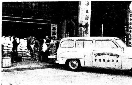
(3) The Catholic Welfare Committee station-wagon being loaded with the packages for the distribution centres.