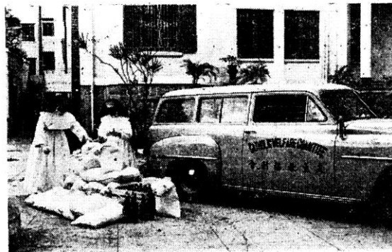
(4) Sisters of the Immaculate Conception at Tak Sun School receiving their allotment which they distributed to 40 poor families who go to them for aid.

During the past week, 220 food packages have been distributed in Hongkong, and 80 in Macau. Each package is valued at U.S.$5 and is the gift of an American Catholic family in the "Adopt a Family" Plan sponsored by the National Council of Catholic Women of America.