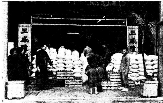
(2) The finished packages stored outside the shop.