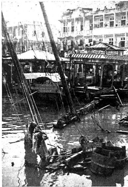
Junks that will sail no more