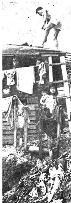
On top of his job