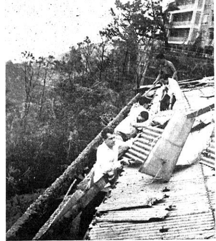
Patching the Catholic Centre godown