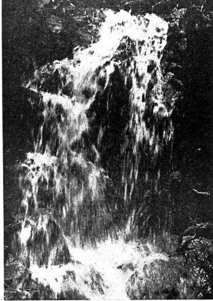
Temporary wayside waterfall